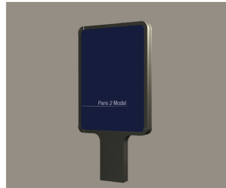
6 Sheet unit