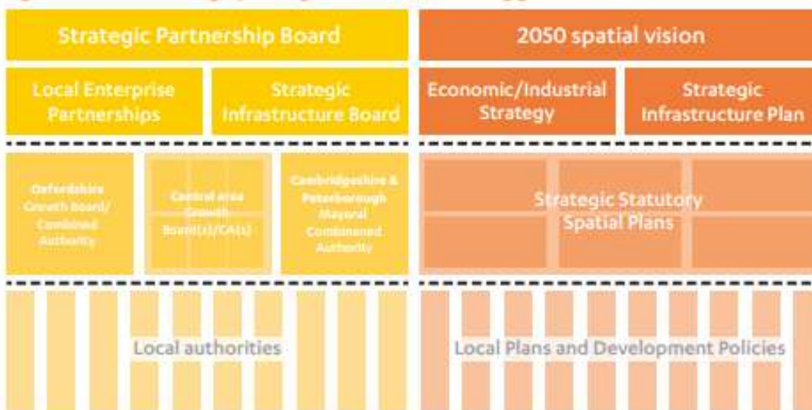
Figure 13: arc-wide strategic planning framework and enabling governance